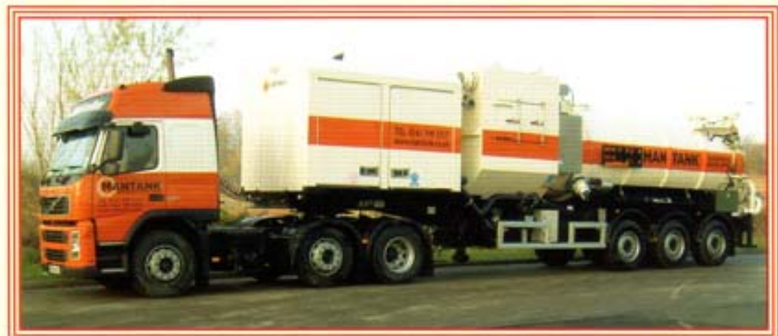
Articulated Dry Vacuumation Unit