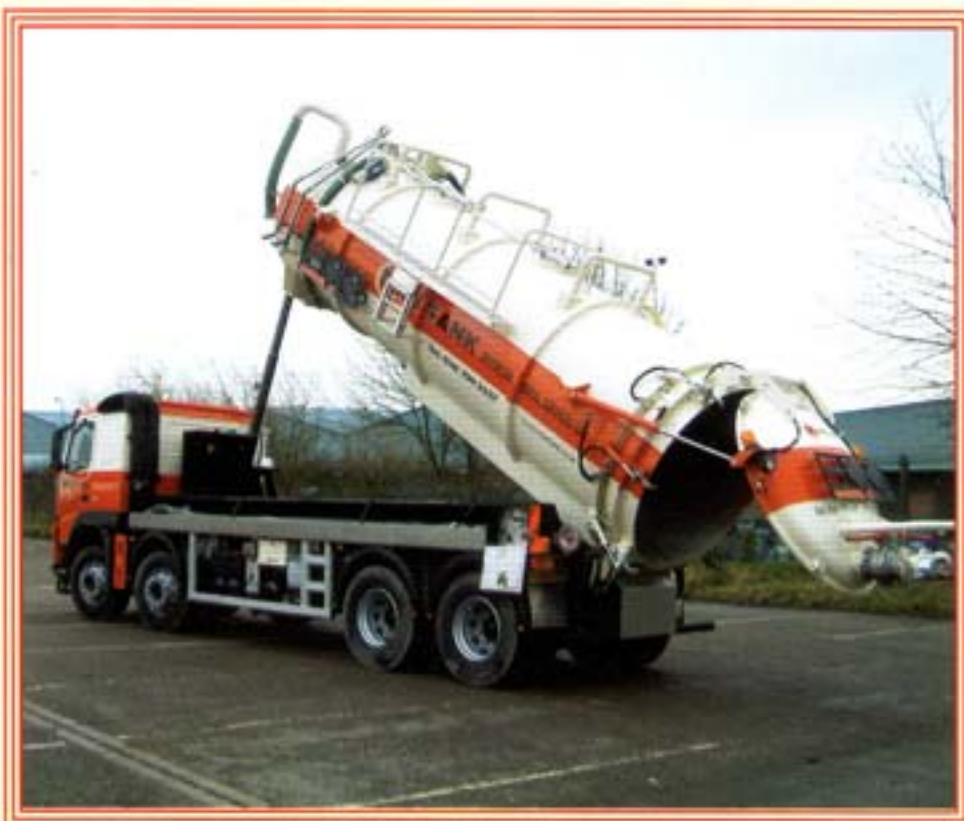
Liquid Ring Vacuumation Unit

The tankers have hazchem marker boards, safety equipment and are suitable for carrying hazardous wastes. Liquid ring vacuumation units, as well as being very efficient at dealing with the heavier more difficult work operate equally well on the more straight forward tasks such as cleaning interceptors, bund areas and oil tanks.