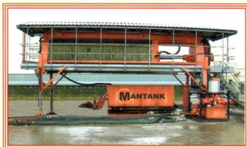
Static Filter Press