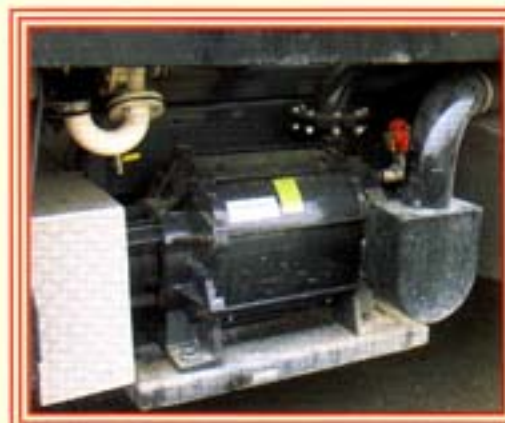
Liquid Ring Pump