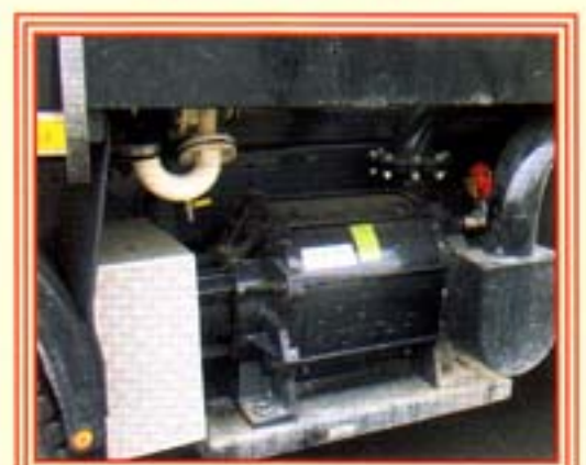
Rear of Recycling Unit